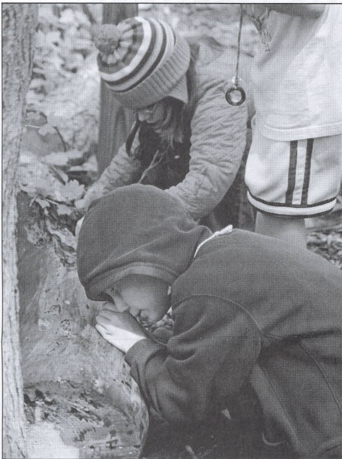
First graders "log in" along the Lakeside Trail.