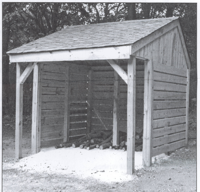
The completed woodshed. We had nearly 60 people attend our first campfire in September. We've been busy filling the woodshed this fall.