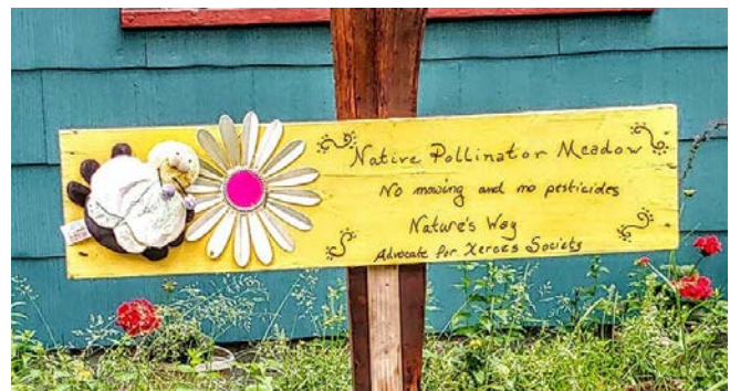
Above: Signs can go a long way toward acceptance of an “untidy” yard.

Below: Weeding can be a relaxing activity, giving you time to de-stress from daily life and the chance to carefully observe and appreciate the diversity of wildlife your garden supports.