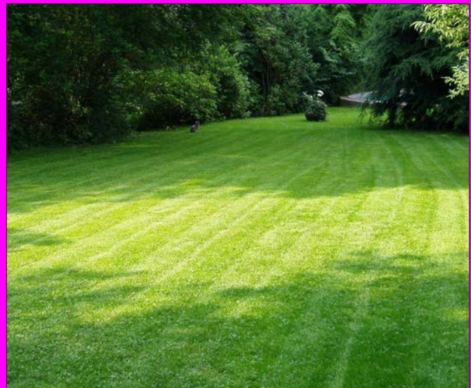
Although white Dutch clover is most obvious, the bee-friendly lawn on left has eight flowers that bloom through the spring and summer. In contrast, the lawn on the right offers little to support pollinators.